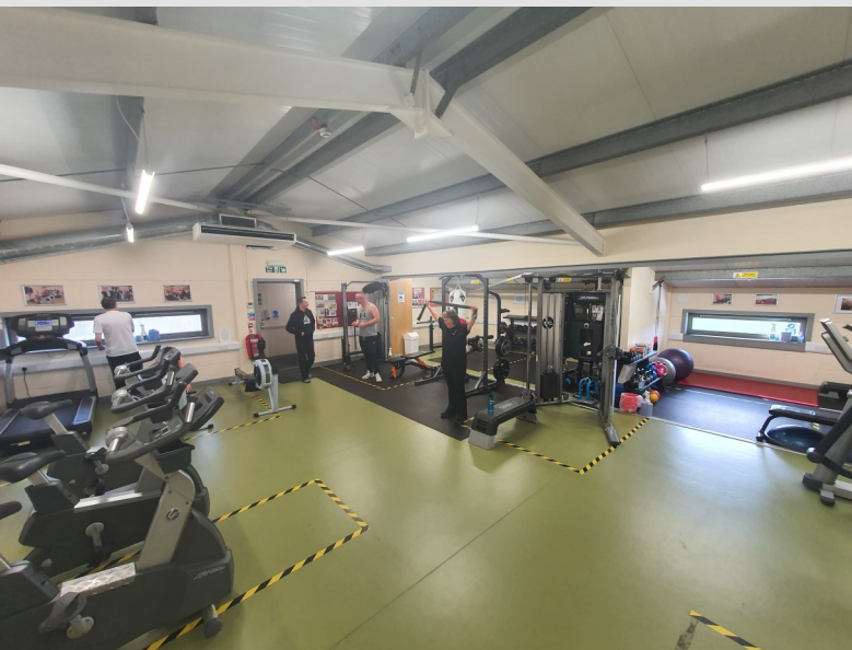
Top left: Large activities hall with stage and sound system. Top right: Commercial grade kitchen facility. Left: Community Gym / Studio. Above: Purpose built meeting room.